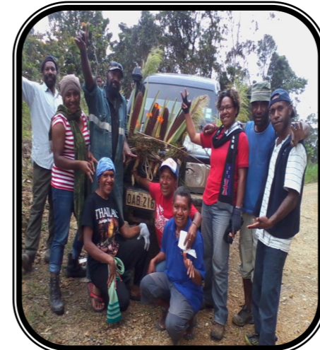
man par-may, 2013