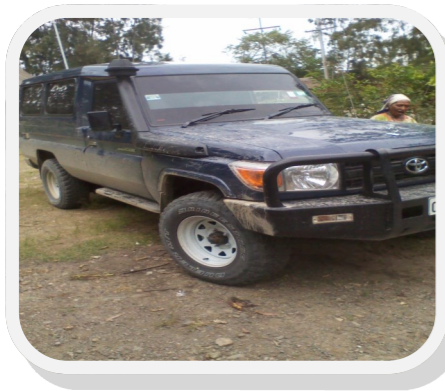
Baseline Suvey Tabibuga Men Session