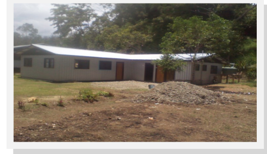
Daddy Boss & his OAB216 toughing the Jimi Road Our NEW OFFICE YAY!!! Our greatest Achievement