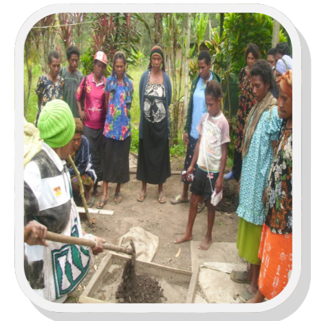
Seen here are participants of the training for fruits and vegetables witnessing a practical demonstration on how to nursery management.