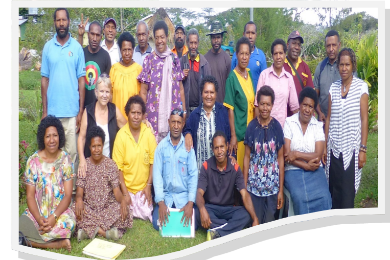
Hu-Rights training ticipants