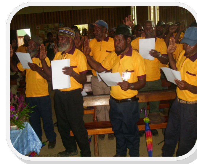
Manda Leaders reading out their consent to maintain peace—Tsigmil EBC Church