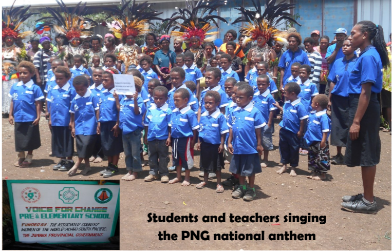
Students and teachers singing the PNG national anthem

The school is fully furnished with all basics required for pre and elementary school education.