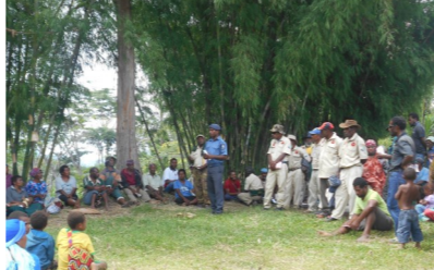
Top to bottom; Village court, Police & Vfc representatives speaking to the communities during awareness