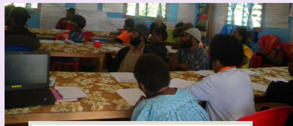
A group discussion session for JWHRDs