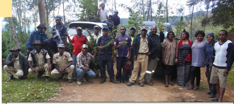
Response & Prevention desk team conducted awareness with Police and Village Court Officials in rural communities of South Waghi