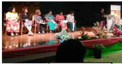
The forum panellists

The participants were women leaders representing businesses, organisations and government entities.