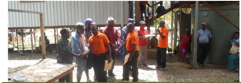
Participants receiving Certificates after successful completion of the training

Through the training they mapped out issues deterrents to peace, justice and