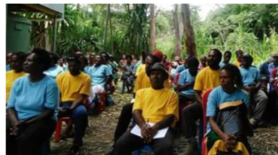
The Community Leaders and VCEs during the graduation

A total of 30 participants graduated with Certificates of Attendants for successfully completing of the one year project Modules.