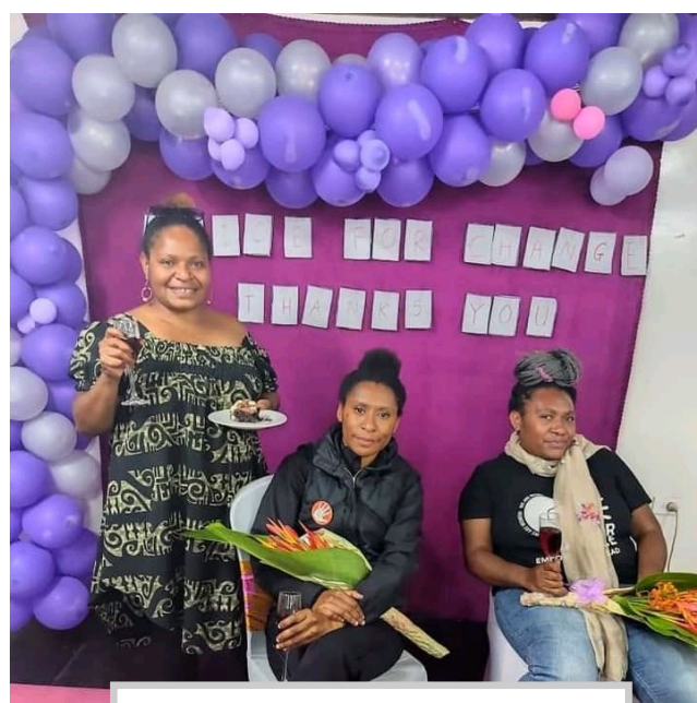
Group photo for the participants