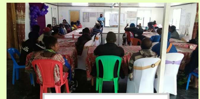
NARI Rep speaking to the farmers

Interested farmers under the organisation group from within and around the community were called in for