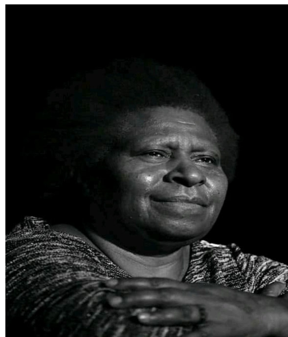
different countries and VfC was one of the participant.

The event took two weeks from 15th to 26th March 2021 that attracted more than 200 participants including government ministers of