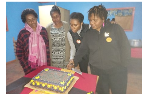
L-R: Oxfam Gender Officer, HWHRDM Program Officer and VfC Legal Aid Team.

VfC is one of the partner that makes up the supervisory role within the Movements Advisory Board.