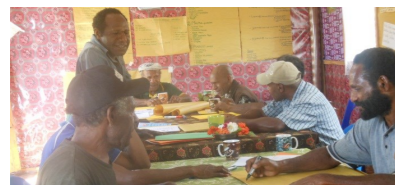
Kuma Leaders during the Training on Gender And Human Rights