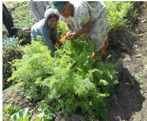
Participants acknowledge and appreciated VFC's role.

A Reflection Workshop was conducted on the 5th of June at the same venue following on the Soil Management Training for the farmers who were engaged under this project. The 12 participants from Soil Management Training plus joining 35 farmers from the four areas of Kukpa, Kugark, Warakar, and Tombil attended the Reflection Workshop. The aim of this was to bring those farmers trained by the project together to collectively discuss, share experiences and give feedback and views to be considered for the next planning. The participants agreed that sequence cropping is the best practice because continues production and marketing is taking place meaning a steady flow of income into the households.