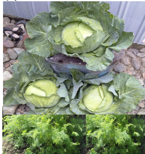
DISPLAY OF MAMA SUGUN'S FIRST VEGETABLES HARVEST.

'Thank you Oxfam for knapsack sprayer, vegetable seeds, insecticides and the training on vegetable production. I am now doing my first harvest of produce.'