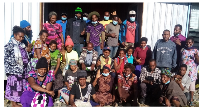
Group photo for the participants

From the 22nd to 24th of June 2021, VfC conducted Gender and Family Farm Team Goals Training to rural farmers of South Waghi under the NARI "Lukautim Graun" Project funded and supported by University of Canberra and Australian Centre for International Agricultural Research.