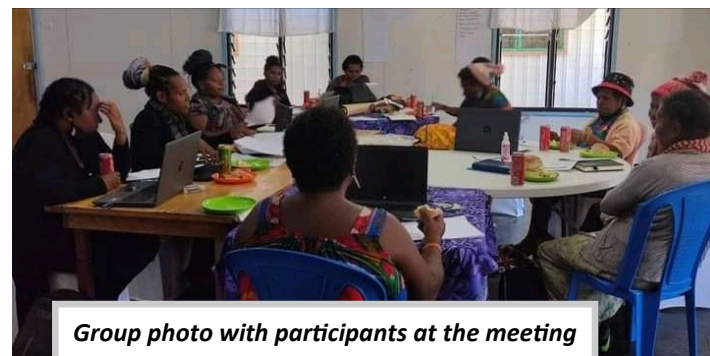
Group photo with participants at the meeting

After a month, an urgency meeting was held again on 7th of May 2021 due to increased number of survivors recorded over the past four months of this year 2021. The team discussed and drafted proper tools and guidelines to effectively manage the increasing number of clients as majority of underprivileged rural women