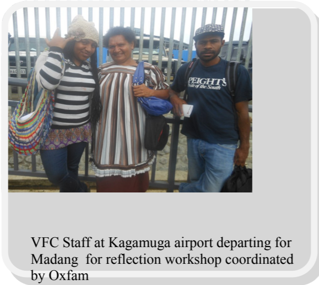
VFC Staff at Kagamuga airport departing for Madang for reflection workshop coordinated by Oxfam

Voice for Change had the opportunity to present the work done on the bottom up approaches to build safer homes and communities in Jiwaka Province. Including the sorcery issues