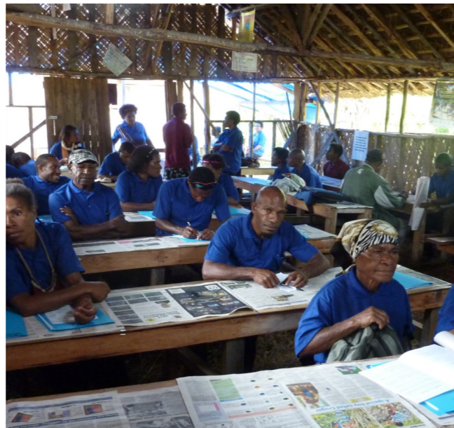
Participants attending the class