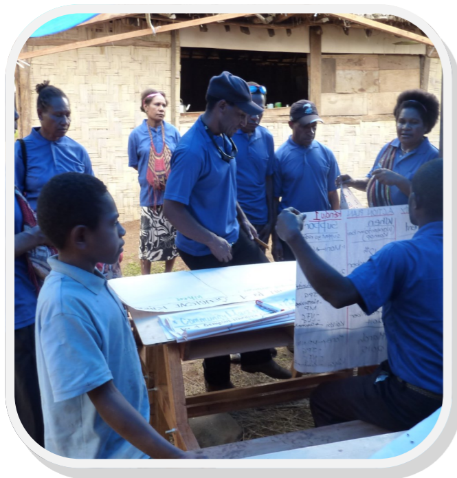
The participants are in groups discussion at Kisap.