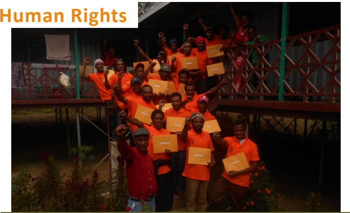
The participants with their Certificates during the graduation

The participants expressed their understanding and appreciation and developed an action plan and made commitments to change their attitudes and behaviours to promote equality and stop violence