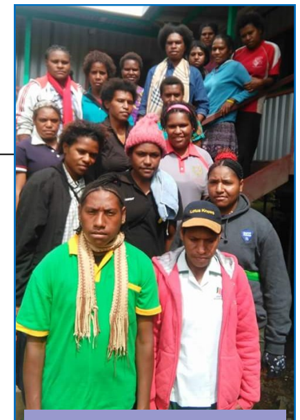
The first registered Young Women and Girls from Jiwaka