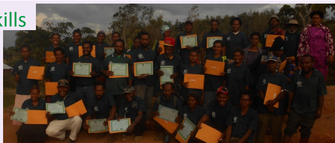
Nukmar and Milang communities with their Certificates

In this quarter under the Women Economic Empowerment Program (WEEM), 91 participants (61 females and 30 males) benefited from the following trainings; Piggery, Cooking & Nutrition, Kaukau (Sweet potato) and Soil Compost trainings.