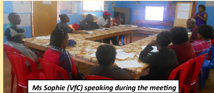
Ms Sophie (VfC) speaking during the meeting

New supplies were also distributed to each