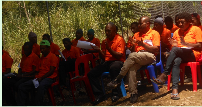
The participants gathering for graduation

At the end of the training, participants planned their ways to reduce and eradicate the social issues that exist within their families and the community.