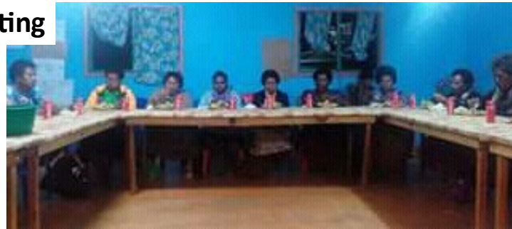
The women participants at the meeting

The meeting was to identify Women Leaders representing different LLGs from Jiwaka who will be participating at the forum. It was also to update on the progress and preparation of the forum.