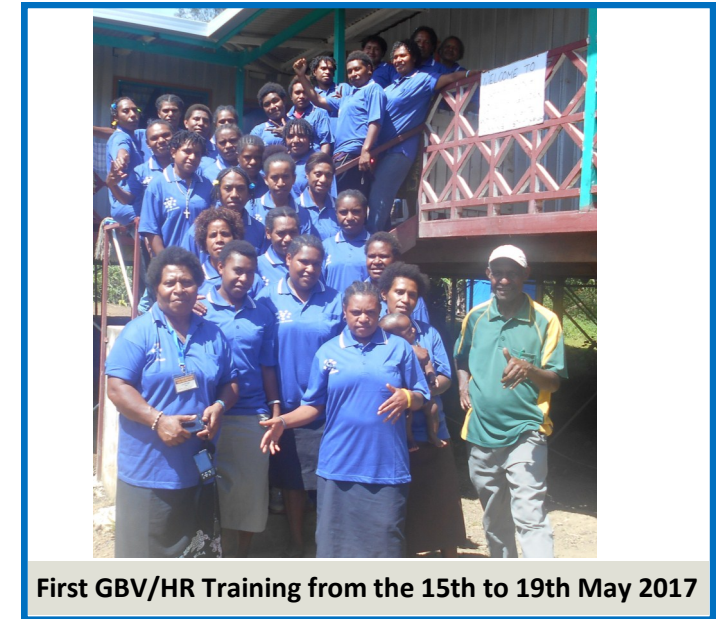
First GBV/HR Training from the 15th to 19th May 2017