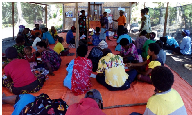
The trainers conducting training for Bung 1 community

The beneficiaries were from Banz 1 & 2 and Bung 1 & 2 communities from North Waghi, and Nukmar and Milang communities from South Waghi. Among the participants were District Administrator, village councilors, teachers and office bearers.