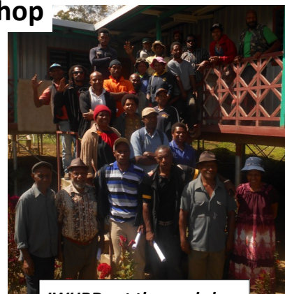
JWHRDs at the workshop

The participants discussed the types of factors and suggested ways on how to overcome them.