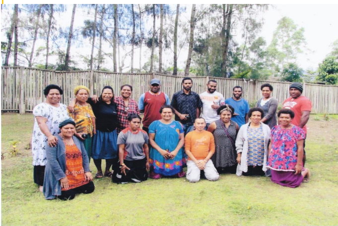
Participants and Facilitators of the Photoshop workshop.

VfC staff took part in a two-day training (16 th -17 th Dec 2014) on Photo Voice facilitated by Centre for Media and Creative Communication of the University of Goroka. The training was funded by UNDP and hosted at VfC meeting room. The other three days focused on documenting the work of VfC. The team documented two of the Extension Workers and their role.