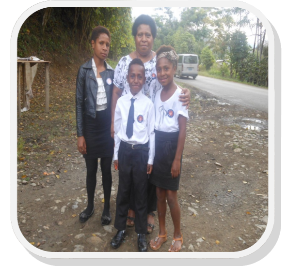
Youth and Male Advocates were also given badges with brief on 16 Days of Activism UNiTE Campaign

Another ten year old boy was asked by his teacher what the badge was all about, and he bravely told him 'we as men must stop Violence Against Women and protect & uphold their rights of Women/Girls'.