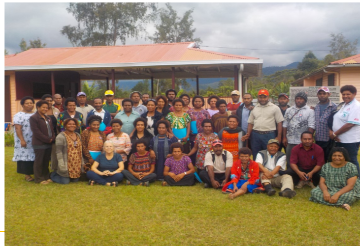
Photo Voice Workshop

A two-day consultation meeting was hosted by the Department of Community Development and UNDP to map out CBOs and NGOs working on EVAW. The meeting was hosted at the Airport Motel in Mt. Hagen. VFC used the opportunity to put up the posters and distribute stop VAW/Girls flyers and batches and provided brief information on the significance of the 16Days of activism. A total of 50 participants represented five highlands provinces: Hela, Wabag, Southern Highlands, Western Highlands and Jiwaka.