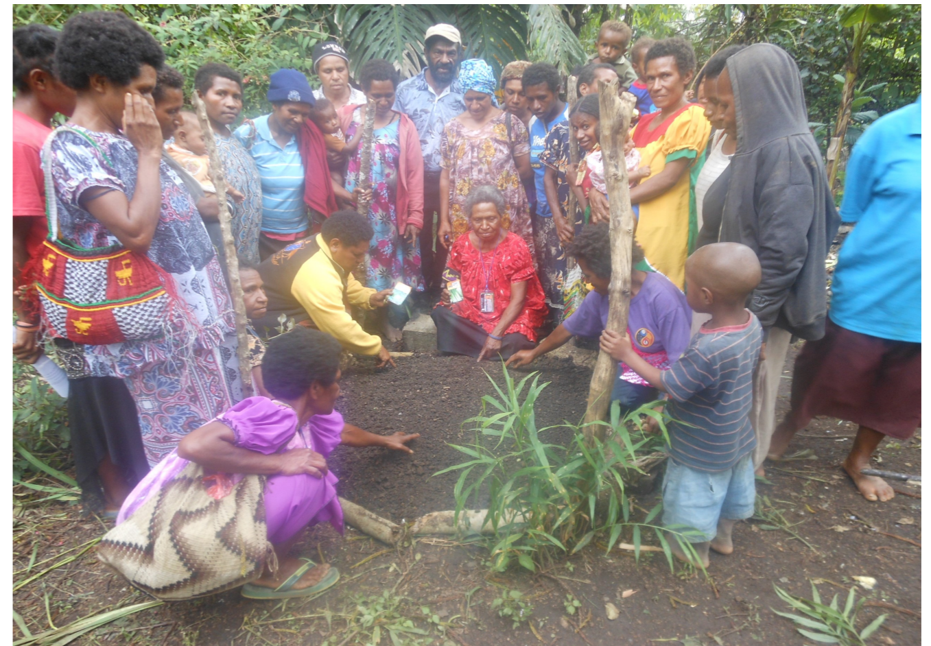
Three Extension Workers taking the farmers through the field nursery training .