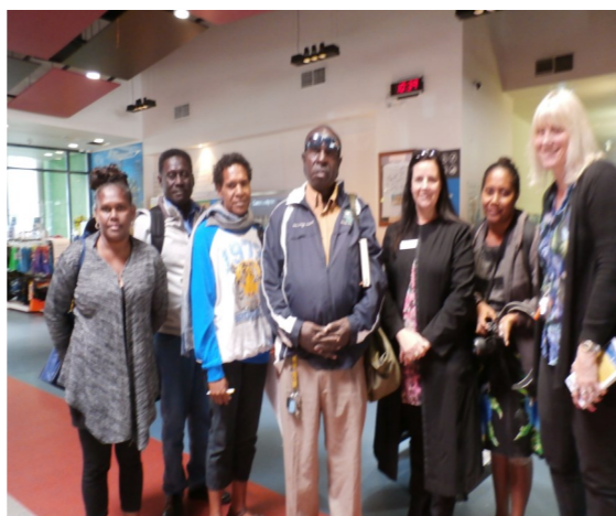
Learning Tour team from the Solomon Island and PNG in Melbourne.