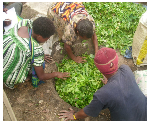
Pictures of Extension Workers Training the CFs: Top: Compost Making Left: Soil Sterilization

Voice for Change is also networking with other stakeholders to develop the capacities and farming techniques of its Extension Workers farmers. The Australian International Agricultural Research (ACIAR)/ Fresh Produce Development Community FPDA team conducted training on the post harvest management and cost of production to the 38 farmers; 11 males and 27 females. The outcome of the training was good. The participants commented that they have never done cost of production and gross margin. They learnt new techniques in working out the profit from their Production cost and they really appreciated the training. Voice for Change also receives requests for training on fishery, poultry and other areas of Agriculture.