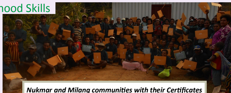
Nukmar and Milang communities with their Certificates

In this quarter under the Women Economic Empowerment Program (WEEP), 162 participants (88 females and 74 males) benefited from the following trainings; Piggery, Cooking & Nutrition, Fish, Duck and Vegetables Production.