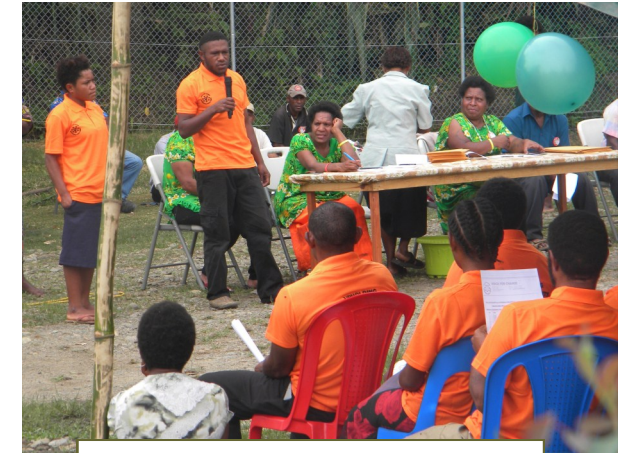
One of the male participant male giving a speech during the graduation

The participants expressed their understanding and appreciation and developed an action plan and made commitments to change their attitudes and behaviours. They pledge to work with their community leaders to uphold peace.