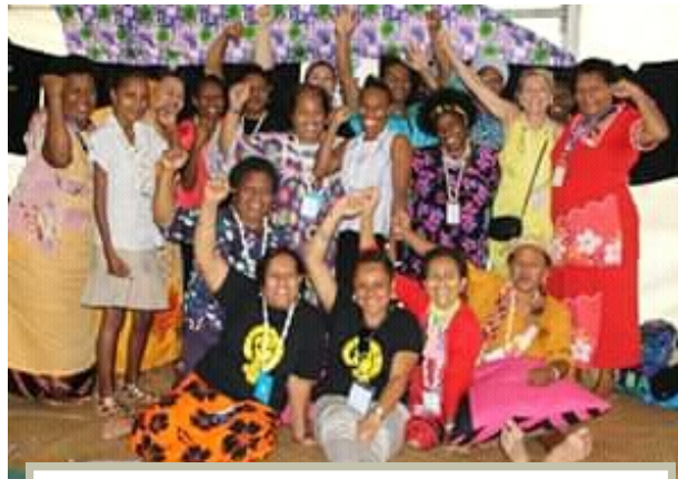
The participants and Vfc team at the conference

Vfc was given an opportunity to speak on the issues women encounter in Jiwaka and around the region.