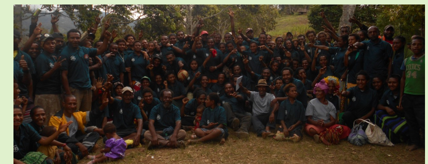
Bunowou community, one of the participating community

communities that were present during the finals days. The officials and community leaders urged the communities to uphold human rights for all including women and girls.