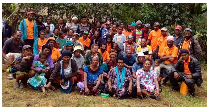
Eka Community group photo after the training

A total of 48 participants consisting of 22 female and 26 male including community leaders and public servants benefited from the training.