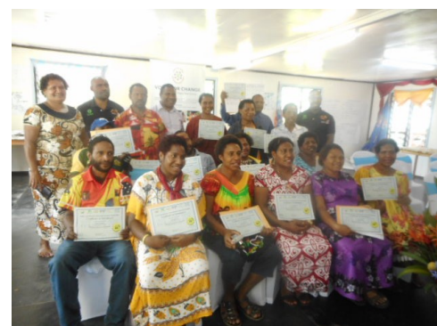
Participants at the Graduation

The training was to learn how to start and improve their business as micro Entrepreneurs.