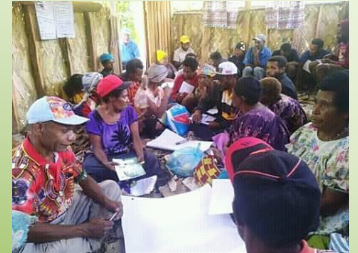
Participants at the group discussion during the training.

A total of 34 participants (18 female and 16 male most youths were students). The total participants were most who have received other livelihoods trainings and are practically implementing their skills and knowledge.