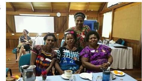
Team Voice For Change at the Mid term review in Kokopo

At the end of the mid term review participants were excited and they explore the WAVE journey. This give them an opportunity to see, feel and understand the partners journey.