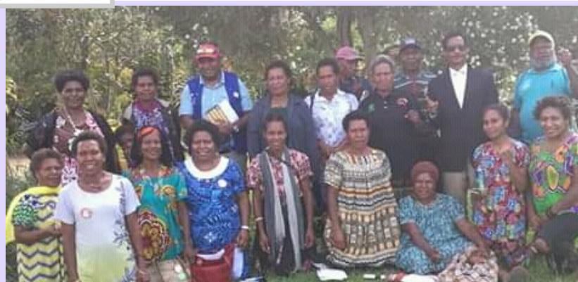
Team VFC with the new committees taking a group photo after the meeting

After the meeting the committee and everyone