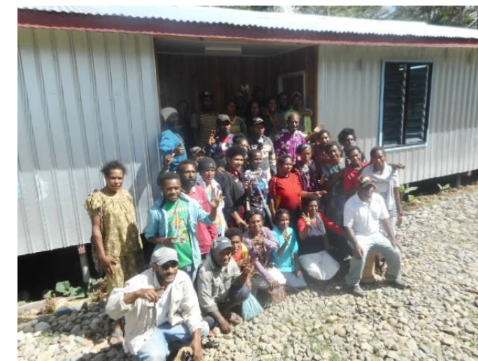
Participants taking a group photo with their Facilitator at the end of the training.

All the participants were really interested during the training, they gave all positive feedbacks and requested for more training.