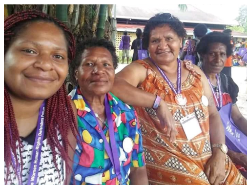
Team Vfc in Buka, Bougainville

Partners learned a lot of new ideas from each other, meet new friends and enjoyed their stay at the forum.