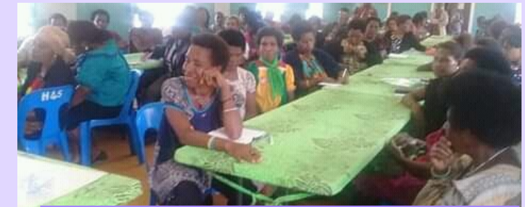
North Waghi Women Leaders at the meeting.

During the meeting the women leaders were really concern and they raised their hands to fight for what is right. Most of them thanked voice for change for taking the incentives to organise such meetings where they can come together to talk on the issues affecting women.