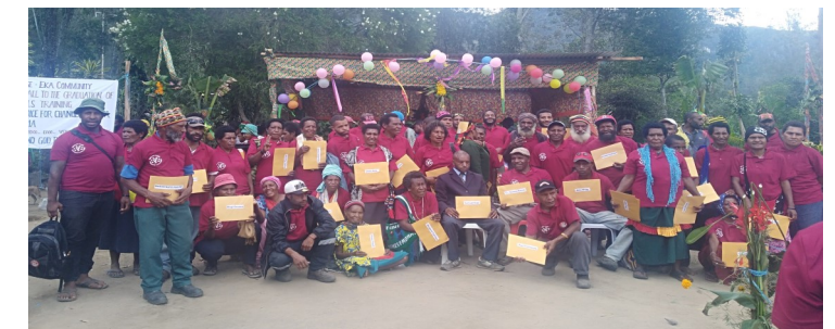
Group Photo taken after the graduation with their certificate

The DKA project help support the community to learn the skills of raising village poultry and piggery, improvement in livestock production & consumption, increase knowledge in growing & management practices, decrease poverty, give them space to share skills/ knowledge and experiences within themselves, increase self reliant and give opportunity to earn income and increase savings.