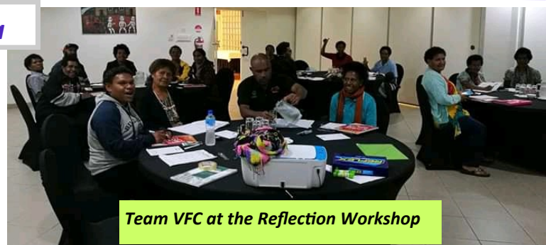
Team VfC at the Reflection Workshop